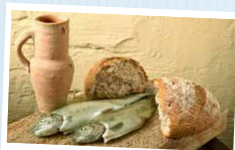
Fresh From the Sea of Galilee

* While we do our very best at making sure all items listed in your itinerary are included, there are times when conditions beyond our control affect your program/ itinerary, including but not limited to air carrier changes, delays, weather, political climate, time constraints, or changes by your tour leader and tour guide.