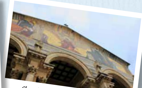
Church of All Nations, Jerusalem