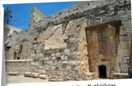
Church of the Nativity, Bethlehem